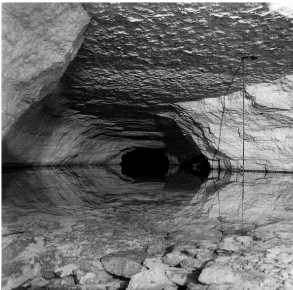
Figure 3: Lake in Weebubbie Cave with water supply pipe, subsequently removed.

The Nullarbor Plain is one of the largest limestone regions in the world at about 200,000 square kilometers in area. It is a flat-lying, shallow marine plain of Miocene age overlain with some Pleistocene dunes particularly near the coast. It is so named because of the lack of trees (null arbor). All the northern part of the limestone is virtually without trees and only has saltbush and grasses up to one meter in height. The climate is arid to semi-arid with rainfall of 260 millimeters per annum close to the coast but only 180 millimeters per annum at the railway on the northern edge of the exposed limestone. The Nullarbor Plain has no