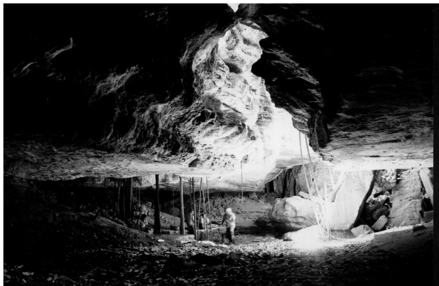
Figure 2: Cave passage in Bullita Cave with fig tree roots.

The caves have not been investigated biologically although bats are known to roost in some of the caves during the wetter times of the year. Vertebrate fossil deposits have not been found. Many of the caves flood in part during the wet season. Given the richness of